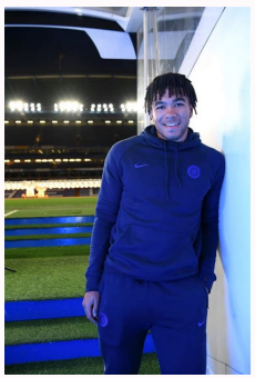
Funny photos chelsea football club. Chelsea football club photos download.